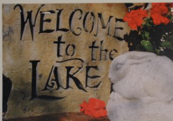
LAKE GEORGE - 2011